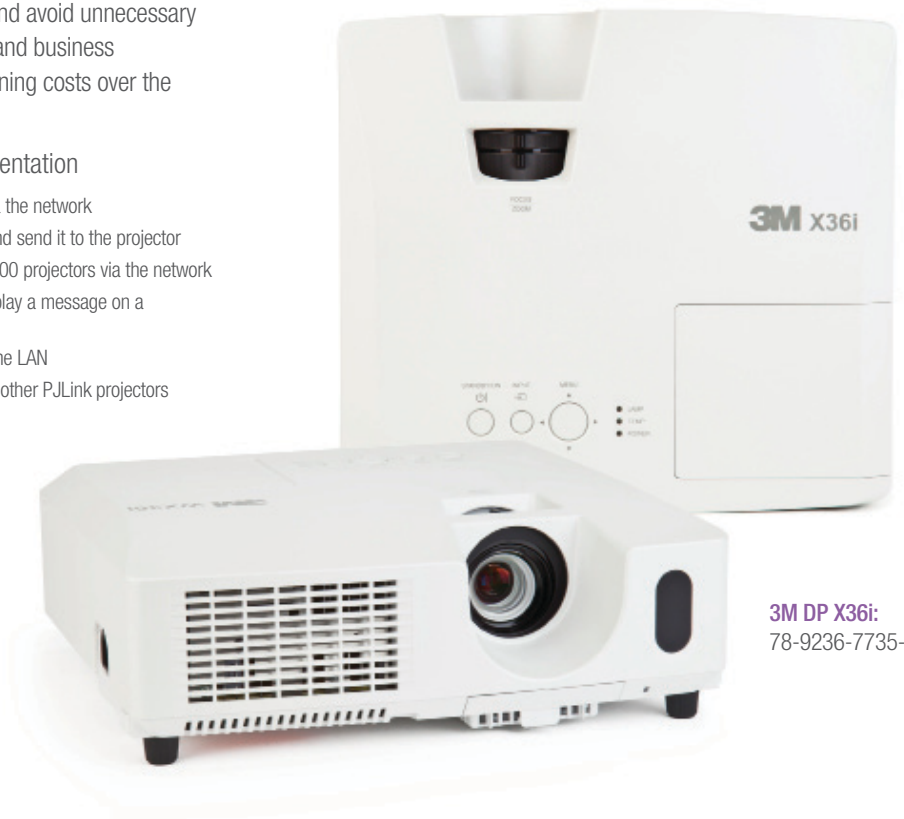
3M DP X36i: 78-9236-7735-1